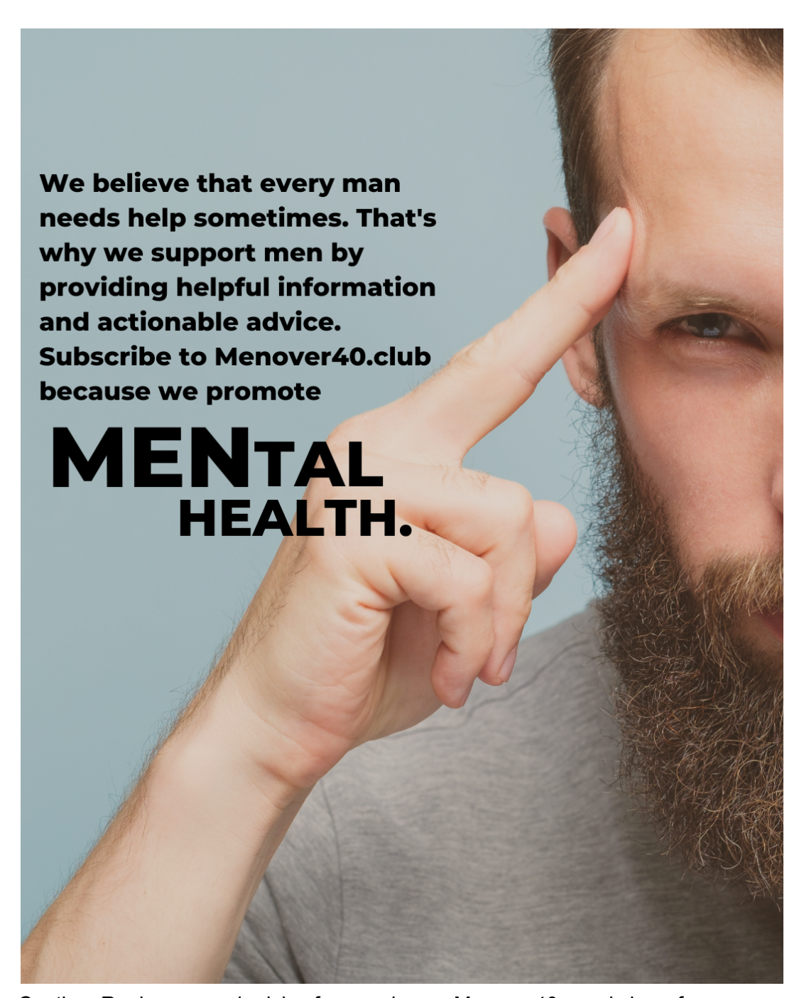
Caption: Real men need advice from real men. Menover40.com is here for you, we are your online man cave. Subscribe today.