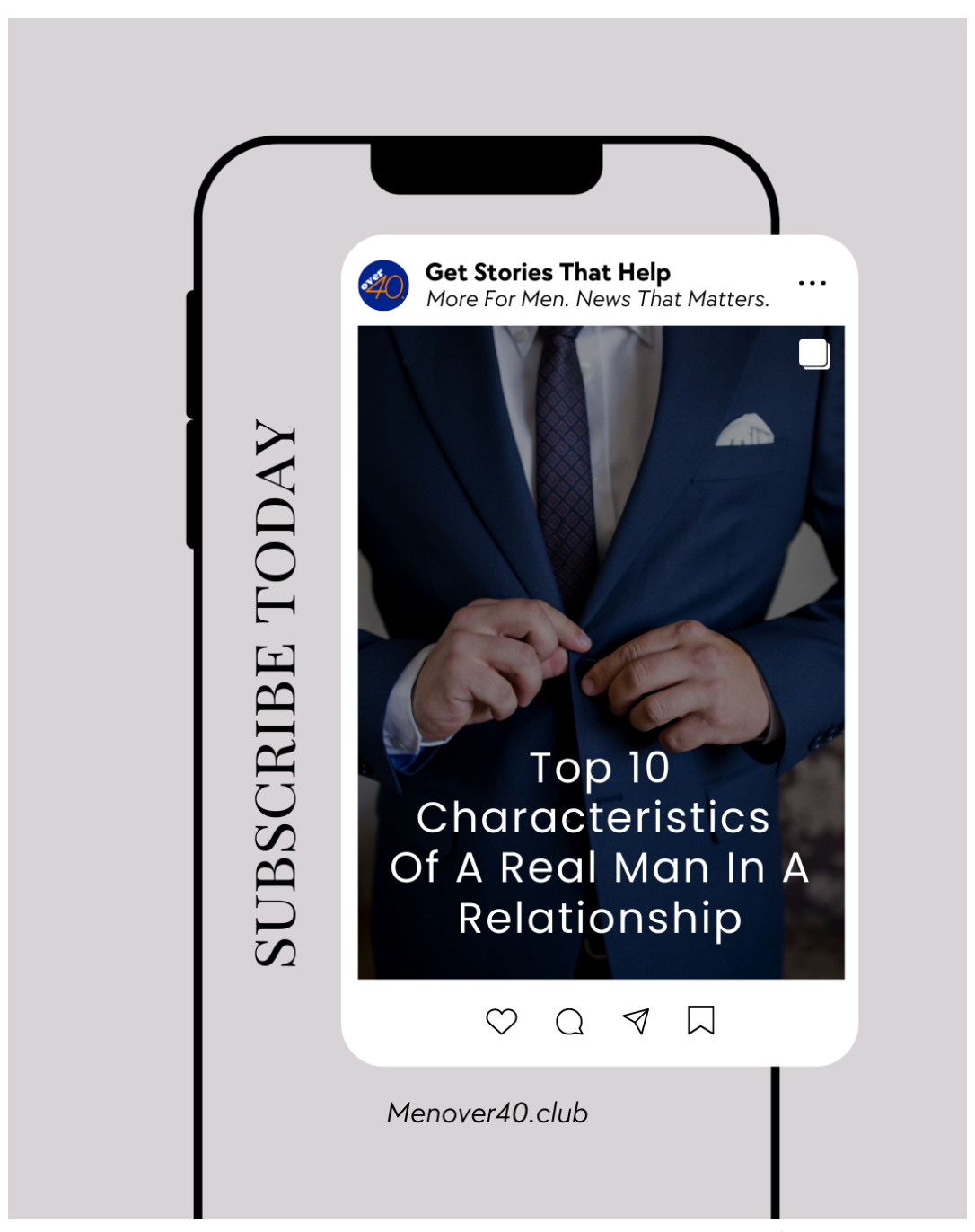
Caption: Are you a real man? Are there any real men in your life? [5] In this article we examine the qualities that are unique to real men. Click the link to find out for yourself.