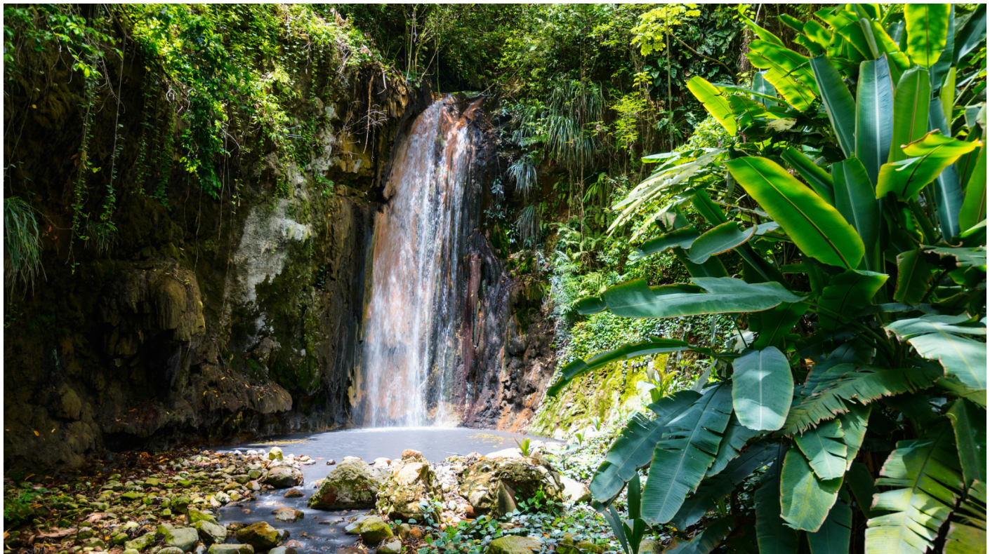
Saint Lucia — A pristine location, wonderful for romance, honeymoons, and anniversary trip ideas.

Whatever experience you want to have, we have pinpointed some of the best holiday destinations. Here is a list of the top 5 best vacation spots for couples in 2022.